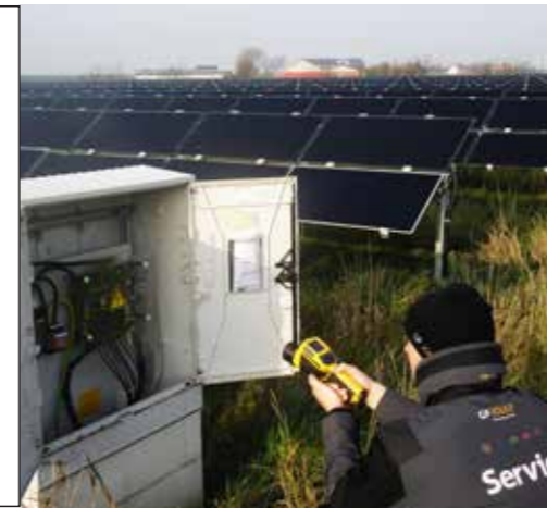
In the event of increased temperatures we can immediately start investigating the cause and rectifying the problem on-site.