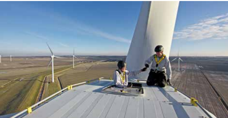
Periodic visual inspection by a GP JOULE service team.

We make sure that your investment grows and thrives - both on the field and on paper. With permanent controlling and our business expertise we ensure that your project generates attractive returns and your capital is managed on a lasting basis. These are just some of the areas we look after for you with the commercial management service.